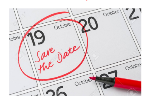
We look forward to seeing you. Mark your calendar and stay tuned for further details!

251 South Olive Street Los Angeles, CA 90012